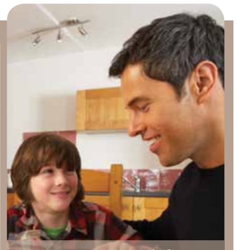
Your Life Your Options Your Choices

Providing uncompromising end-oflife care to patients and families since 1980: Routine Home Care, Continuous Nursing Care at Home, Inpatient Care, and Respite Care. Interdisciplinary teams of physicians, nurses, hospice aides, social workers, chaplains, bereavement counselors, and trained volunteers guide patients and their families with clinical care, psychosocial support, spiritual guidance and volunteer assistance.