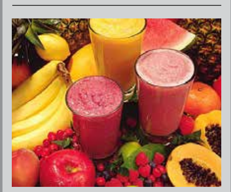
Maintaining Adequate Nutrition: A Continuing Challenge in ALS See pg. 10