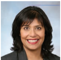
Enu Mainigi Williams & Connolly